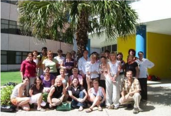
Course participants, Brisbane, December 2005