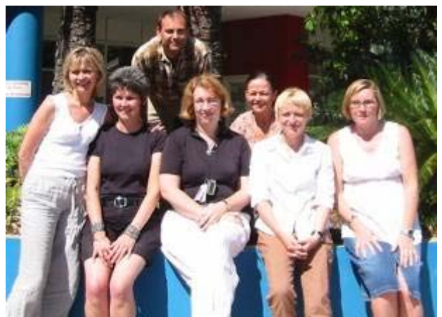
The instructors and organisers of the Brisbane Course

develop a network of experienced therapists”